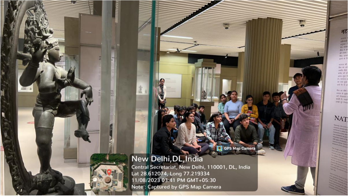
New Delhi, DL, India Central Secretariat, New Delhi, 110001, DL, India Lat 28.612074, Long 77.219334 11/08/2023 03:41 PM GMT+05:30 Note : Captured by GPS Map Camera