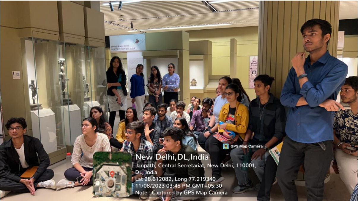
New Delhi, DL, India Janpath, Central Secretariat, New Delhi, 110001, DL, India Lat 28.612082, Long 77.219340 11/08/2023 03:45 PM GMT+05:30 Note : Captured by GPS Map Camera